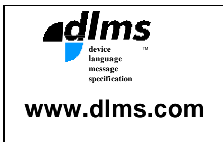
Figure 1: The trade marked DLMS Logo

Standardisation is highly organised, world wide, by continents or by countries. Moreover, it is specialised, e.g. IEC for electrical belongings and ISO for all other business including data processing. This complexity calls for an easier way to do first steps in implementing the "Device Language Message Specification" standard for meter data exchange. The DLMS User Association co-ordinates the use of the "Device Language Message Specification" in a broad way, and takes care that all the different existing standards (including ISO/OSI) are considered. The first field of activities englobes Interface Objects describing features of energy meters, mapping them to DLMS, and transporting the data units via existing channels as e.g. the telephone network.